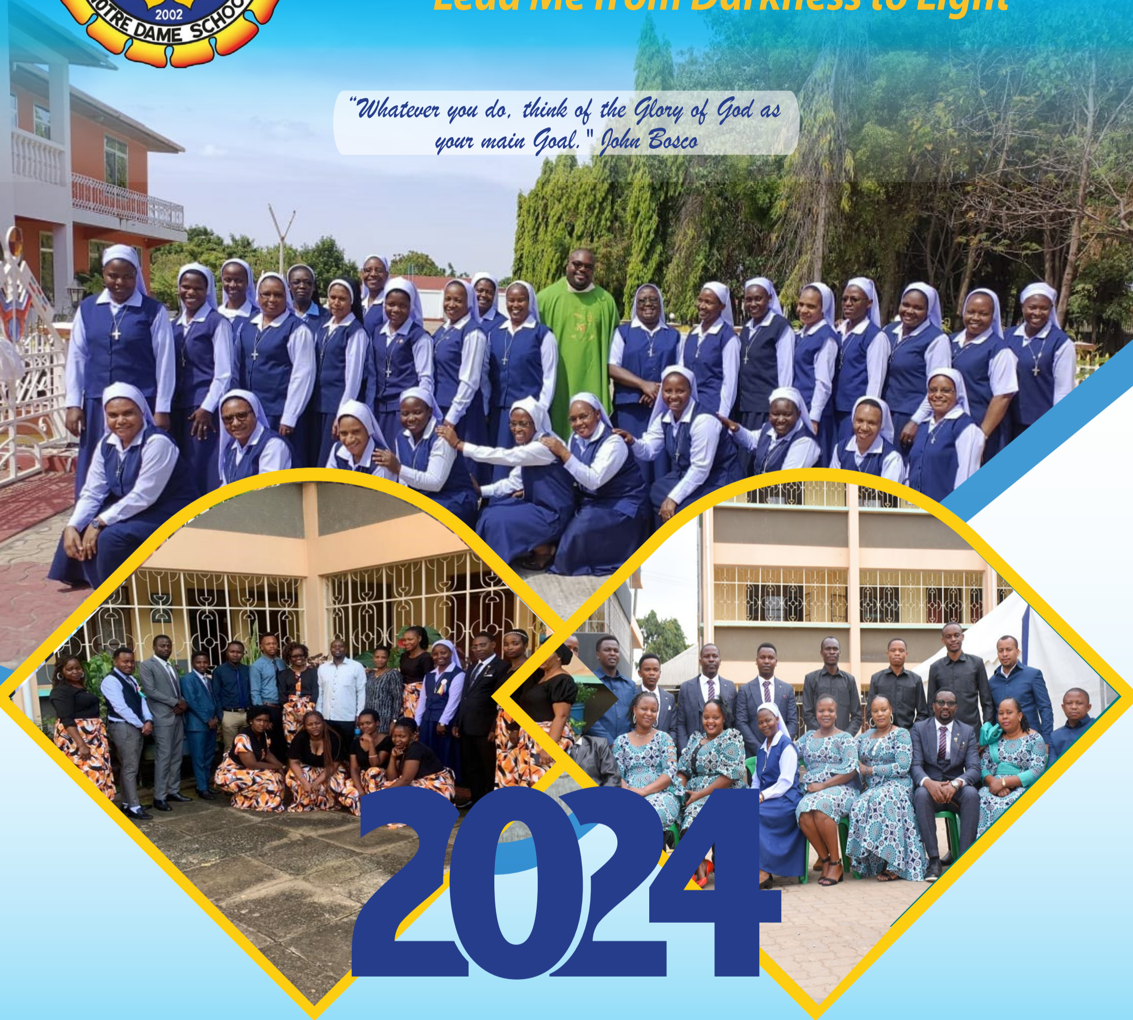
Upper: The Sisters of Notre Dame Left: Primary Staff Right: Secondary staff

"Whatever you do, think of the Glory of God as your main Goal." John Bosco